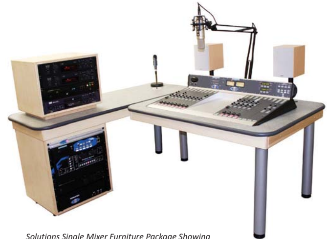
Solutions Single Mixer Furniture Package Showing an S2-25 Mixer.