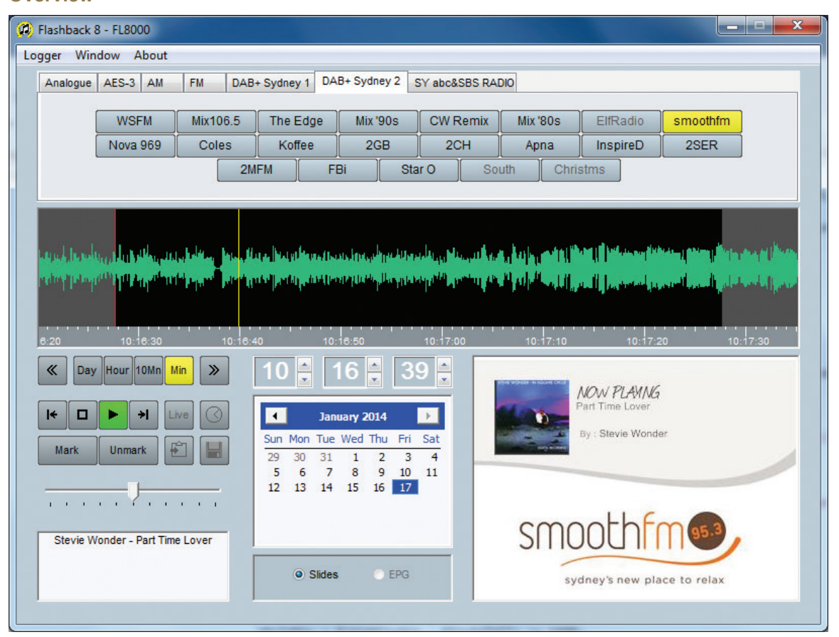
Fig 3-1: Flashback Window Page