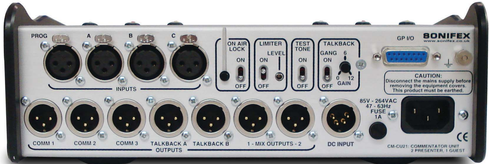
CM-CU21 Commentator Unit Rear View.