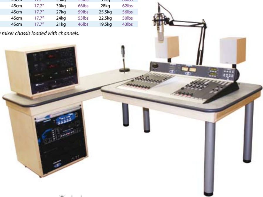
Solutions Single Mixer Furniture Package Showing an S2-25 Mixer.