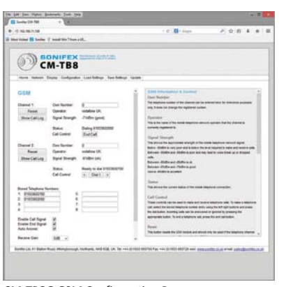
CM-TB8G GSM Configuration Page.

Telephone calls are made and received using the embedded web server or directly using the channel controls. The CM-TB8 can store 8 telephone numbers and each channel can speed dial the required number.