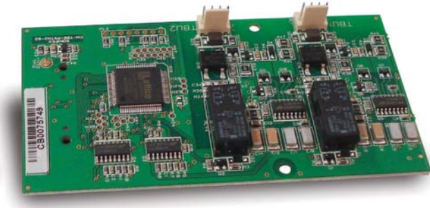
CM-TBT Dual PSTN Card For the CM-TB8T.

The CM-TB8T is the CM-TB8, 8 Channel Talkback Control Unit, with the CM-TBT add-in card fitted.