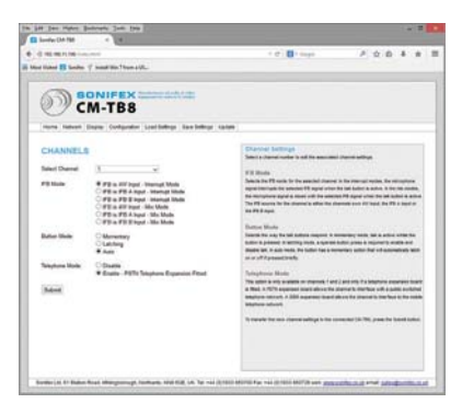
CM-TB8T Channels Config Page.