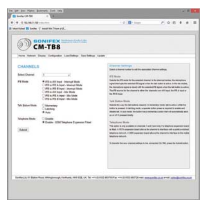
CM-TB8G GSM Enable Page.

IFB modes are fully supported on the telephone channels allowing selected input signals to be routed to a connected telephone call.