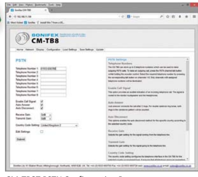
CM-TB8T PSTN Configuration Page.

The hybrids are fully configurable and are easy to setup via the CM-TB8 embedded web server. Simply select your location from a country code list to automatically configure the telephone interface for local