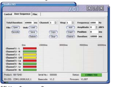
SCi User Sequence Page.